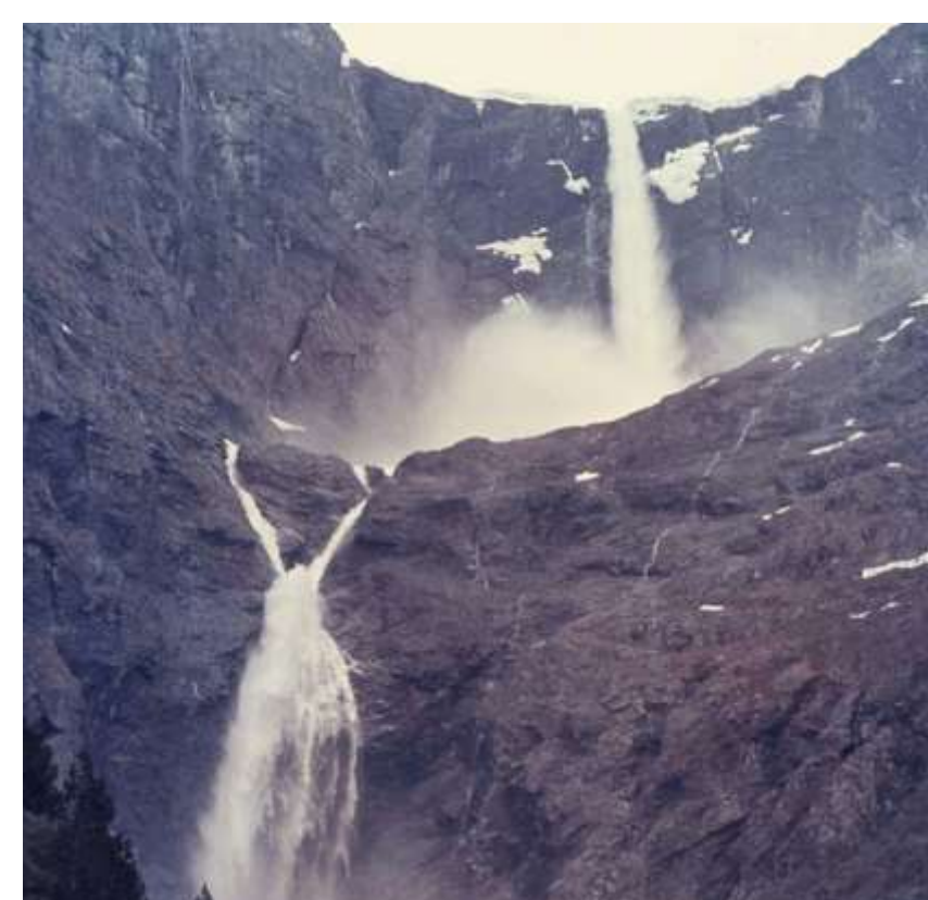
Mardøla, Norway. Climate action 1970

https://pub.cicero.oslo.no/cicero-xmlui/bitstream/handle/11250/2740385/OrderudAndKelmanPrinted-Nov2011.pdf?sequence=2&isAllowed=y